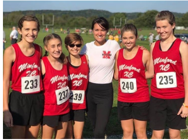
The JH girls cross country team.